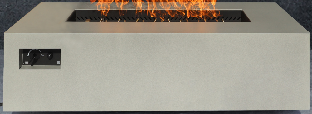
R60 Shown in Sand Pebble