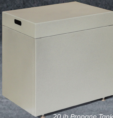
20 lb Propane Tank Cover (Sold Separately)